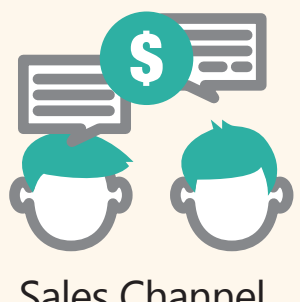
Sales Channel Coordinator